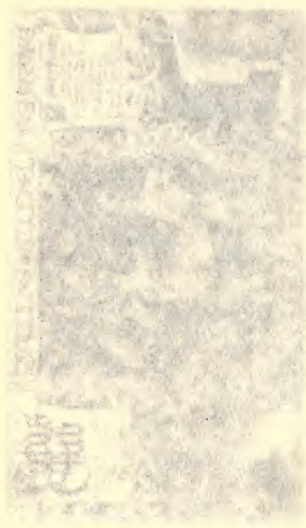
Menu of the Yule Tide Feast, 1910